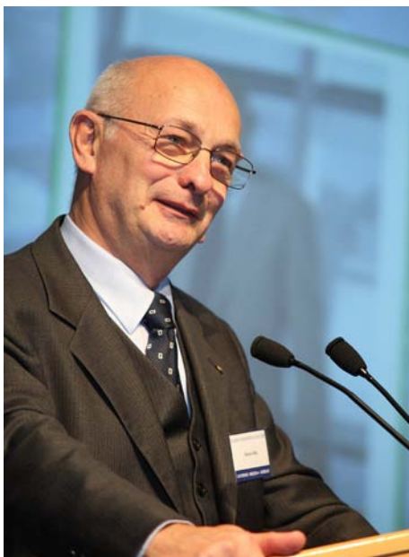
Enrico Villa, MEDEA+/CATRENE Chairman

More than 600 partners from 23 countries participated in MEDEA+, contributing 28,500 person-years to 90 projects out of the 104 initially labelled over 8 years. There was a positive balance between large and small companies – with a 34% SME participation and a significant contribution from universities and research institutes. The programme obtained important successes in communications, automotive electronics and smart card technologies. It also developed the necessary supporting technologies in the form of 45 nm node processes in line with the industry road map, lithography equipment that is now serving 65% of the global market and innovation at material and substrate levels.